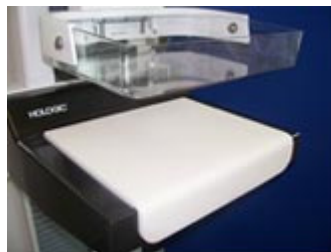
The MammoPad difference